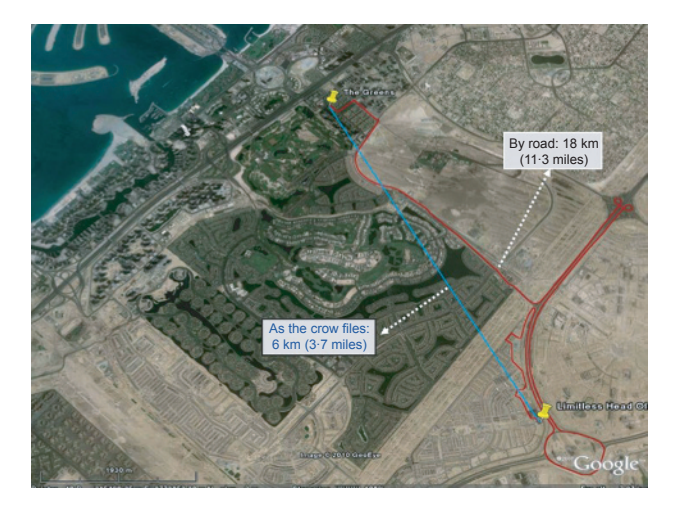
Figure 2. The lack of places to turn left tripled the distance of the author's evening commute home. The morning commute was one-third as long, because there were more places to turn right

Traffic roundabouts have reduced the friction inherent in the left turn. However, widening them to three or four lanes has proved very dangerous for drivers, and impossible for pedestrians. The lack of intersections that allowed left turns extended the present author's nightly commute home – 5 km as the crow flies – to 18 km (see Figure 2). Fortunately, for any car but the many Porsches or Ferraris, this ridiculous route could be cut in half by