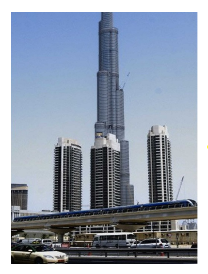
Figure 5. Cars, taxis, vans, buses, trucks and the metro stream by the world's tallest building

transportation network. Just as important as connecting the dots, the existing single-use dots need to be transformed into more complete and complex districts and neighbourhoods. New and retrofit development is best located near metro stations, with the highest densities within a quarter-mile radius. To be fair, this type of infill is exactly what many US cities also need to do, if they are to overcome the equally unsustainable imprint of single-use zoning and the leapfrog development of endless suburbs.