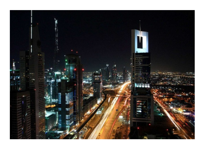
Figure 1. Stylised high-rises line and shine on Sheik Zayed Road, Dubai's ultra-wide and ultra-long high street

traffic, gasoline consumption and greenhouse gas emissions. There simply are not enough intersections, especially ones that allow left turns, which is the point of greatest conflict – the Achilles heel – of any vehicular network.